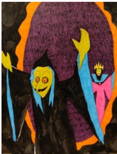
Beatriz Monteavaro draws inspiration from pop culture, including Disney icons such as Space Mountain and Snow White.

Info: 489-9313 or rauschenberggallery.com