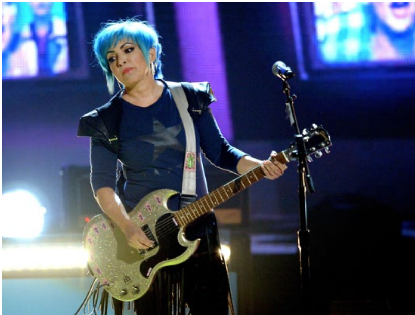
Jane Wiedlin of The Go-Go's

"I'm sure I should brush up on the songs," she says. "But I have been playing these songs since way back when I was 12. I'm very familiar with them."