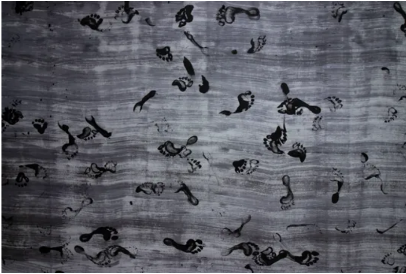
One of the paintings in John Cage's "STEPS: A Composition for a Painting" series will also be displayed at Rauschenberg Gallery. This one was created years ago with Merce Cunningham Dance Company.