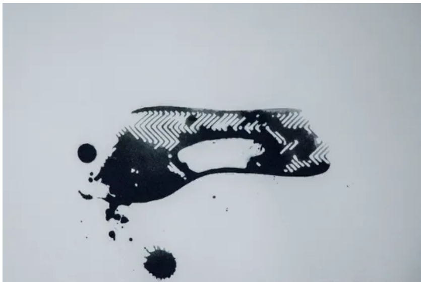
A close-up of John Cage's "STEPS: A Composition for a Painting," part of a series of collaborative works using a set of written instructions from Cage and a large paint brush to create painted footprints on a mounumental-size canvas.