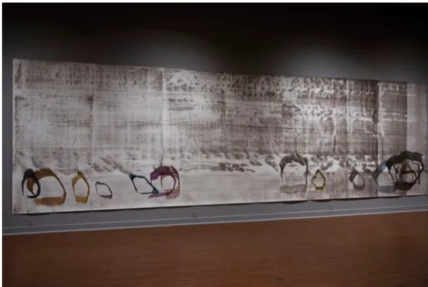
John Cage's recently rediscovered 1990 painting, "New River Rocks and Washes"