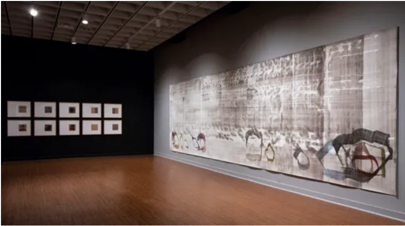
John Cage's recently rediscovered 1990 painting, "New River Rocks and Washes" debuted April 11 at Bob Rauschenberg Gallery.