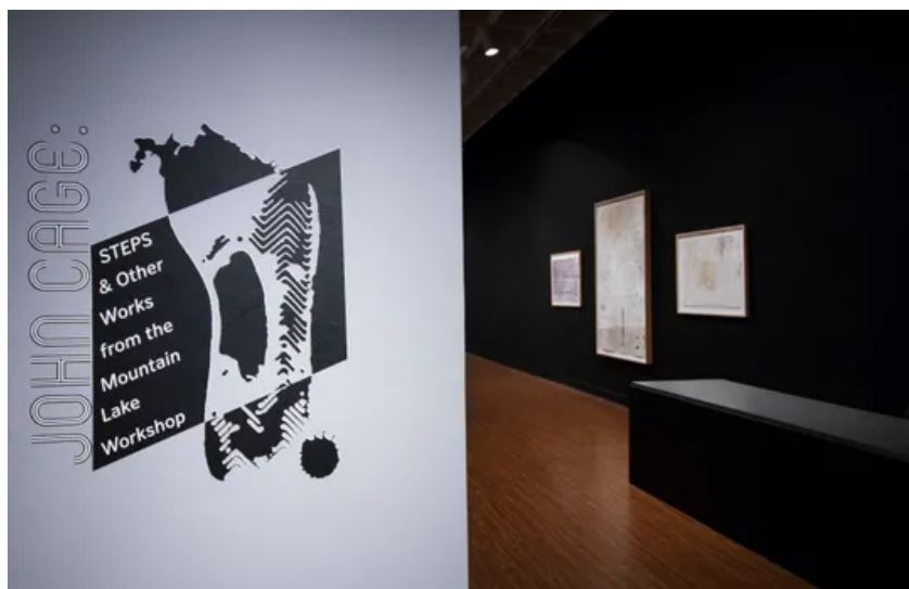
John Cage’s recently rediscovered 1990 painting, “New River Rocks and Washes,” is being displayed at Bob Rauschenberg Gallery, along with other collaborative works from Virginia’s Mountain Lake Workshop.