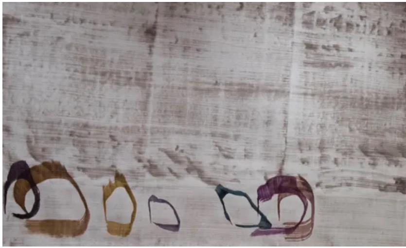
A close-up of John Cage's recently rediscovered 1990 painting, "New River Rocks and Washes"

Now — rediscovered just a few months ago — the painting is being displayed for the first time anywhere at Bob Rauschenberg Gallery ( http://www.rauschenberggallery.com/ ) on the south Fort Myers campus of Florida SouthWestern State College. The exhibit continues through July 27.