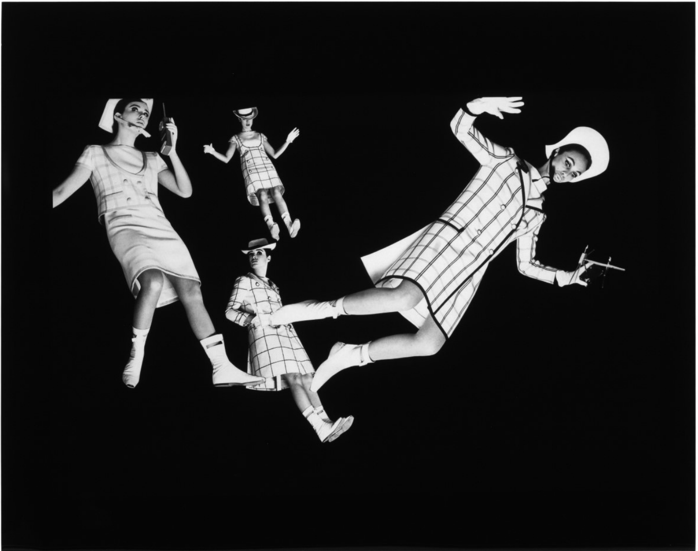
Andre Courreges, Moon Girl collection, 1964.