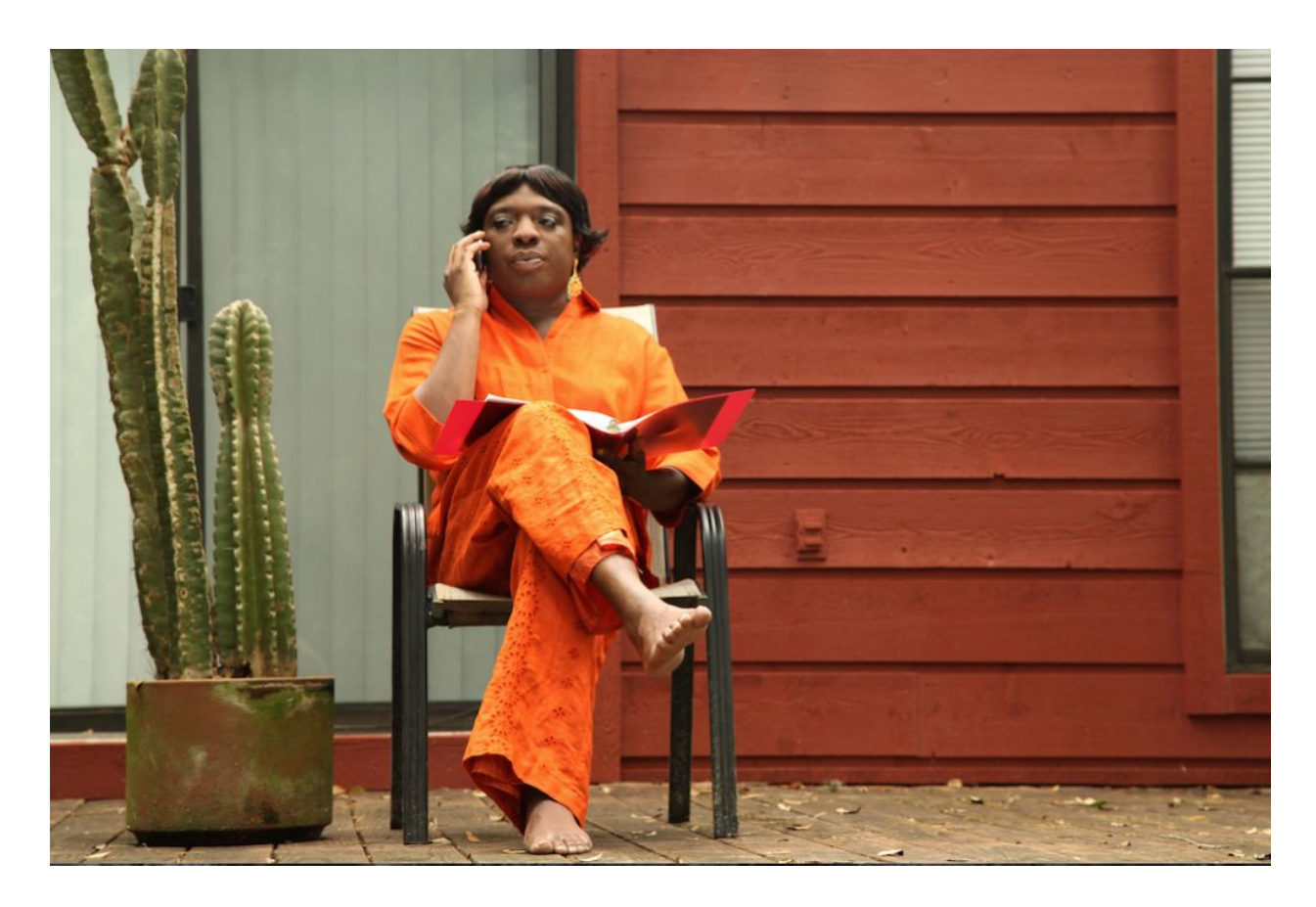
Florida Queen, photography. Image courtesy of the artist

Collaborations is also host to a debut film series created by Linzy and starring Franco. The ten episodes chronicle the lives of the characters Odessa and Katessa as they navigate the tumultuous worlds of art, music, and theater. This series in many ways departs from Linzy's previous work, as both he and Franco contribute to the voiceovers. In another exciting departure from Linzy's previous films, the series contains meta-films. These films within the film are also performed by Franco and Linzy.