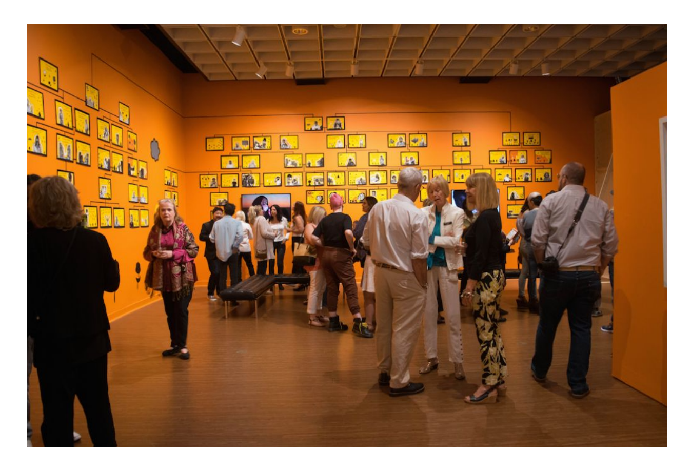
Attendees, photo documentation.