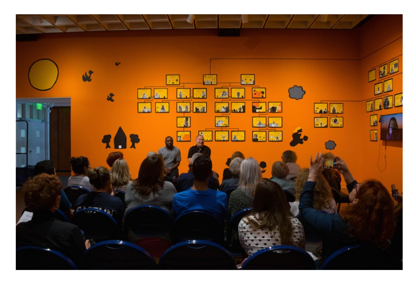
Attendees, photo documentation.